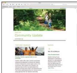
Sign up for e-Newsletters at verdanthealth.org

There are several options to stay better connected with the Verdant Health Commission online: