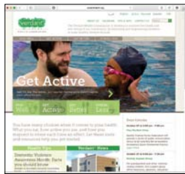
Visit us at verdanthealth.org