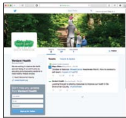
Follow us on Twitter @VerdantHealth