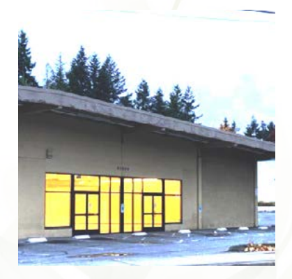
Community Building 17216 Hwy 99 Lynnwood, WA 98039