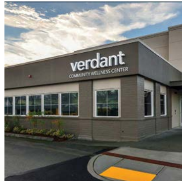
Verdant Community Wellness Center